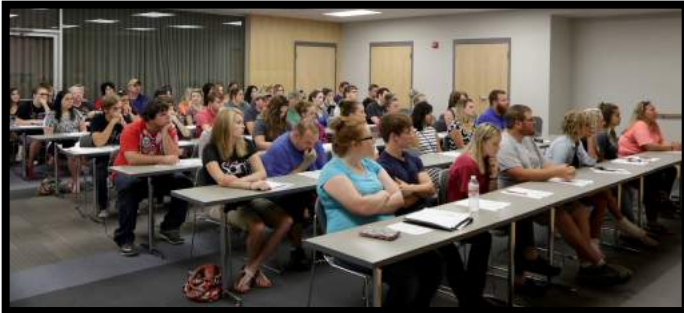
Aug 2-11: Record turn-out for New Student Orientations! Aug 25: Knocker balls were a huge hit at the Welcome Back event.