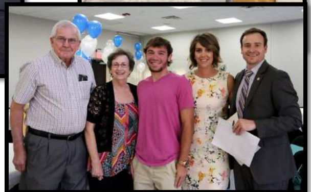
Sept 20: Scholarship recipients and donors had the opportunity to meet and greet at the 2016 Scholarship Reception.