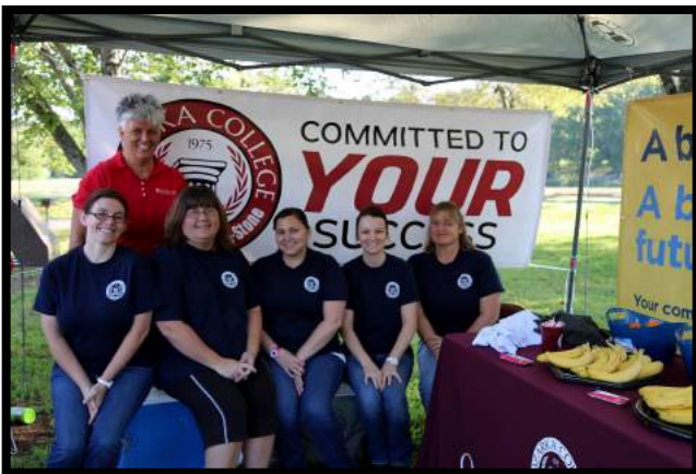
Sept 3: Ozarka College – Mammoth Spring Nursing students volunteered at Ozarka Foundation’s 5K.