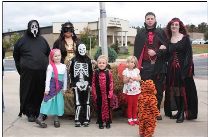
Costume Contest winners.