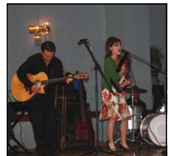
Coleman & Cone

To purchase tickets, contact the Foundation Office at 870-368-7371, 800-821-4335, or purchase them online at www.ozarka.edu .