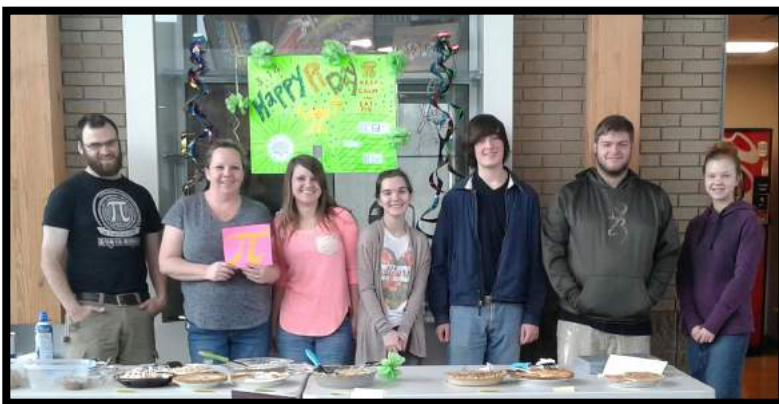
March 14: Students and staff in Mtn. View raised $160 for the AR Children's Hospital during "Pi Day" festivities.