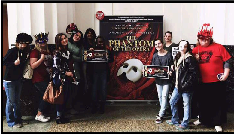
March 9: TRIO students experienced the Phantom of the Opera in Little Rock.