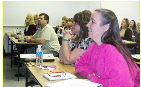
Students gave breakout sessions their rapt attention.

further explored his earlier point about being an effective communicator. He informed each of his three sessions about how the spoken word is translated by the recipient based on their choice of words, tone of voice and body language. He suggested that each persuasive exchange include an introduction of your point of view, an assurance that you understand your audience's perspective and finally your appeal for whatever is to be