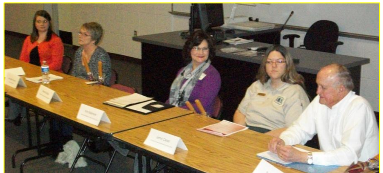
An employer panel gave students insight into available jobs in the community.