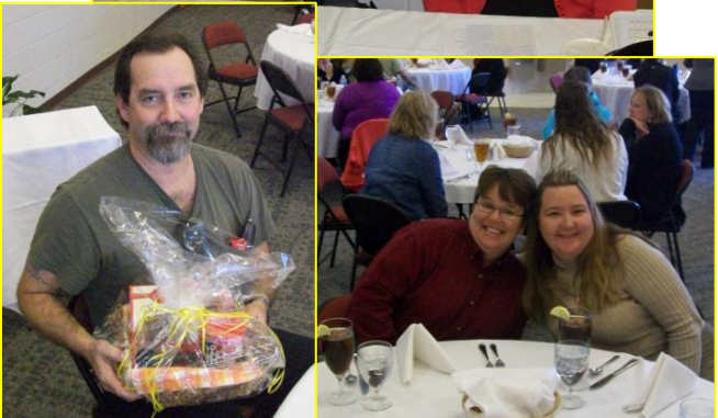
Smiling faces were in abundant supply at the 2012 Employability Skills Conference at Ozarka College.