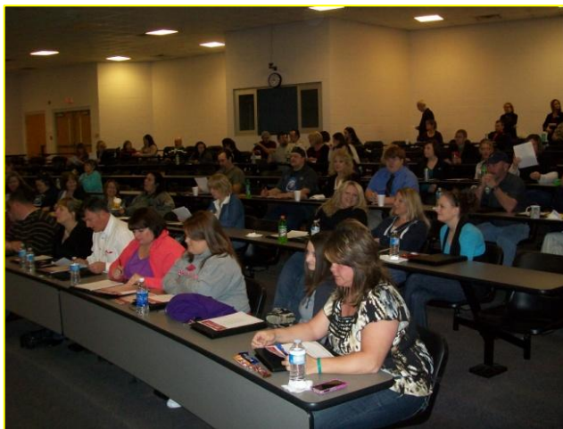
Students filled the Miller Building Lecture Hall for the opening session of the Employability Skills Conference.

The 2012 Employability Skills Conference, hosted by Career Pathways and Student Success, on Friday, March 9, was a successful exploration of how to be a stand-out applicant in a tough job market. Forty-nine students from a variety of degree areas are now better prepared to send professional correspondence, handle tough interview questions, manage their social media and become excellent communicators.