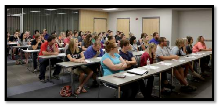
Aug 2-11: Record turn-out for New Student Orientations! Aug 25: Knocker balls were a huge hit at the Welcome Back event.