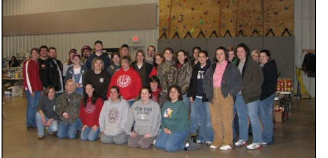
More pictures on page 4