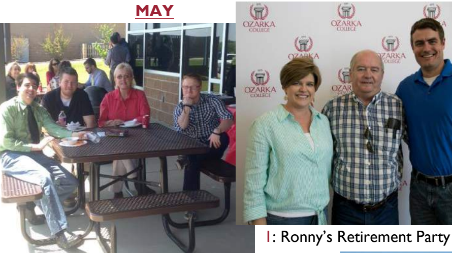
4/27 – 5/1: Faculty Appreciation Week