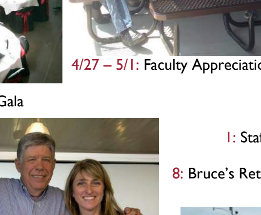
4/30: Foundation Gala