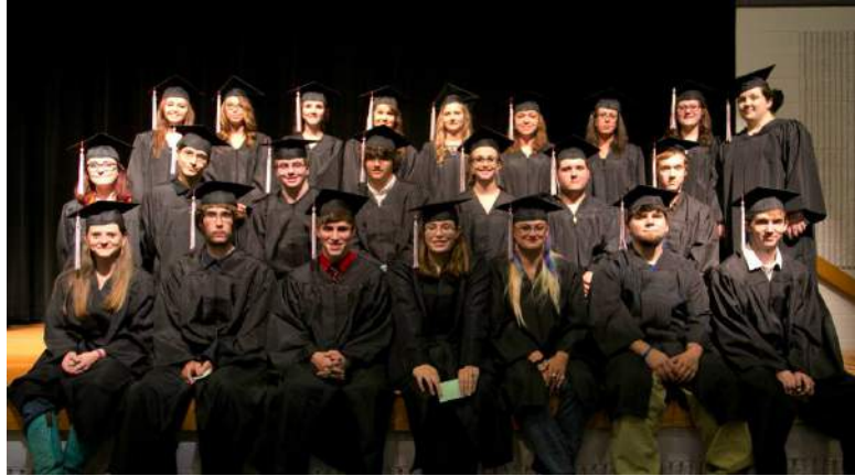
14: GED Graduation