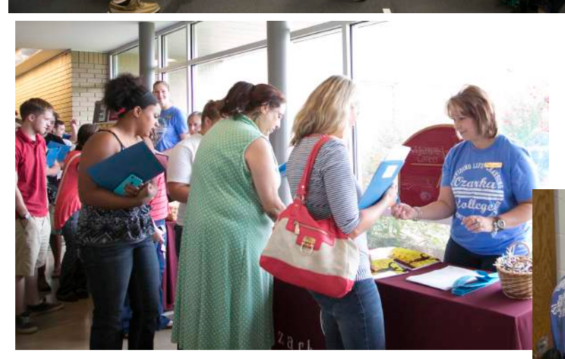
5: New Student Orientation in Mtn. View & Melbourne

4: New Student Orientation in Ash Flat and Mammoth Spring