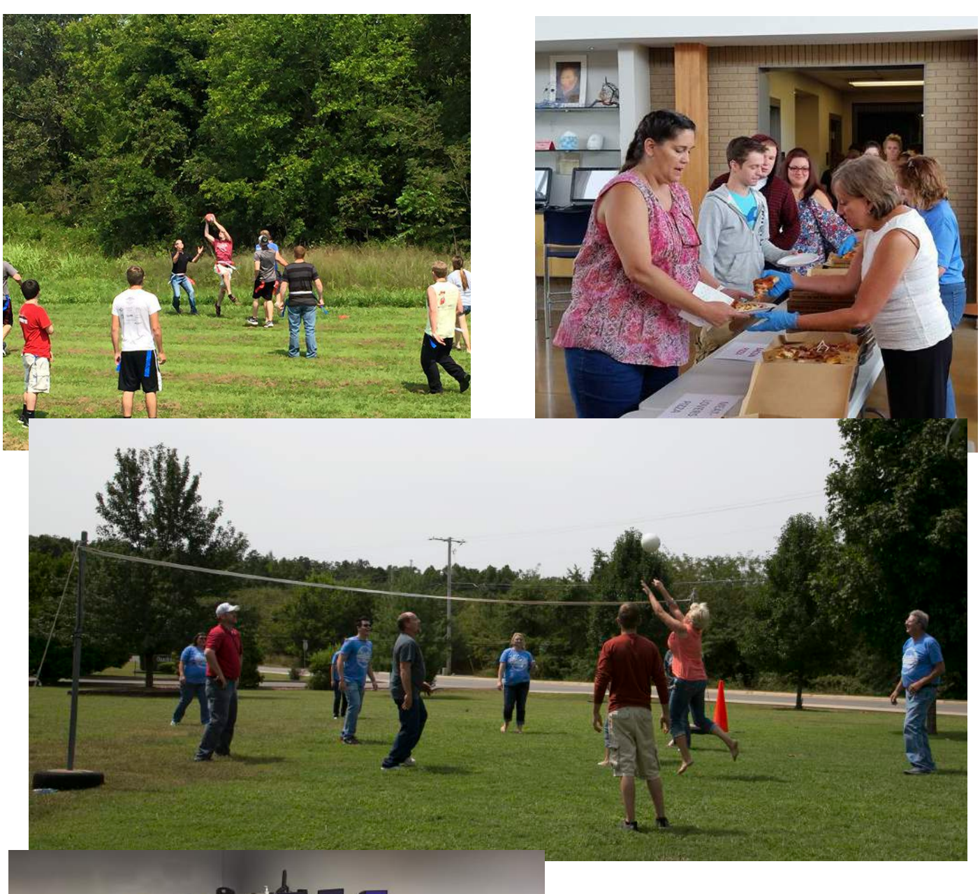
27: Welcome Back events