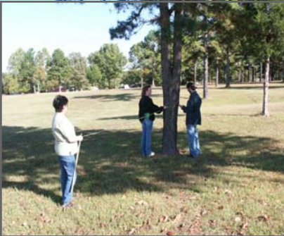
Students taking tree inventory at Ozarka in Melbourne.