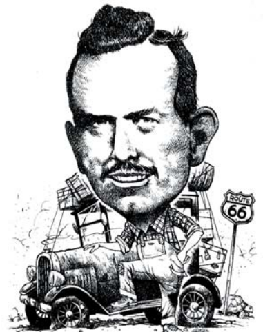
Author, John Steinbeck

Keep informed by READING the local newspaper, the Campus Connection, or Ozarka website for more on this event.