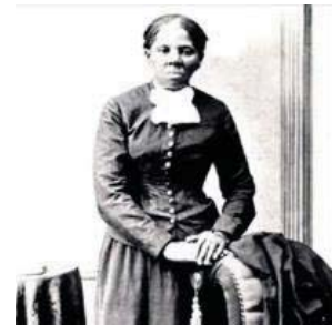
"Portrait of Harriet Tubman."