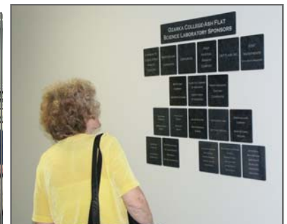
Guests admired the plaques memorializing Science Lab donors.