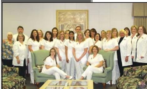
Spring 2009 Melbourne LPN Class

Practical Nursing graduates at Ozarka College were honored at a Recognition Ceremony in the John E. Miller Education Complex on May 5, 2009.