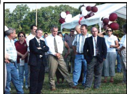
Stone County School officials and other guests at the ceremony..