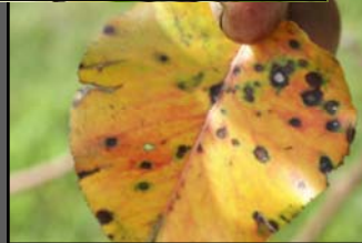
Dave shows two types of fungus: Russet (top photo) and Blight (Bottom photo).