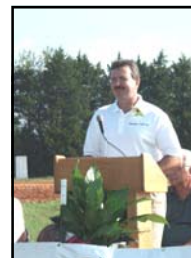
Stone County Judge Stacey Avey.