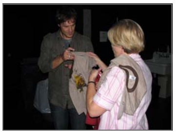
Group members were very nice to sign many autographs after the performance.

the Horizon Award and Group of the Year. Their video for "Boondocks" was also nominated for Group/Duo video of the year by CMT.