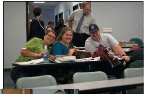
Various Pictures from all three events.