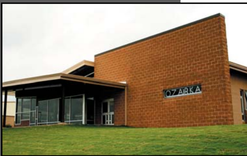
New facility at Ozarka - Ash Flat and students utilizing the student center complete with WIFI and cyber café.